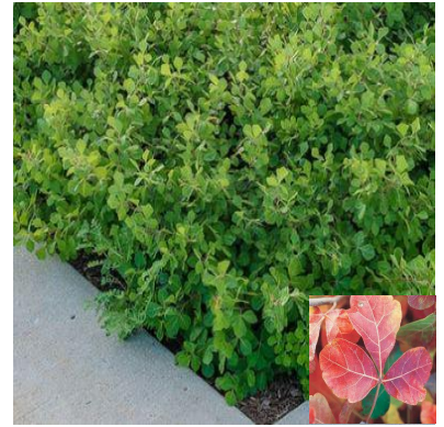
AROMATIC SUMAC RHUS A. 'GRO-LOW' LIGHT: FULL TO PART SUN HT: 2 FEET WD: 7 FEET LOW SPREADING SHRUB GREAT FOR GROUND COVER WITH BRIGHT ORANGE FALL COLOR