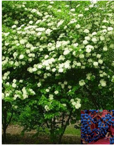
BLACKHAW VIBURNUM VIBURNUM PRUN.

LIGHT: FULL TO PART SHADE HT: 7 FEET WD: 3-4 FEET VASE SHAPED SHRUB WITH AMAZING BERRIES AND FALL COLOR