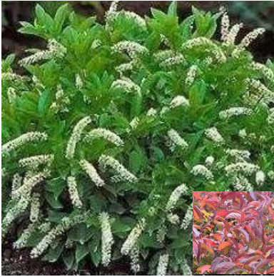
DWARF VIRGINIA SWEETSPIRE ITEA V. 'LITTLE HENRY' LIGHT: FULL TO PART SUN HT: 2 FEET WD: 2 FEET SPRING FLOWERING AND SUCKERING SHRUB GREAT FOR CREATING A LOW HEDGE WITH BURGUNDY FALL COLOR