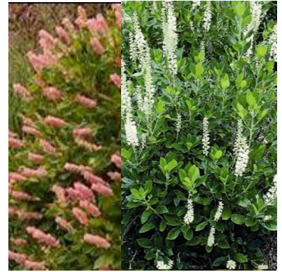
SWEET PEPPERBUSH CLETHRA A. (VARIOUS) LIGHT: FULL SUN TO PART SHADE HT: 4 FEET WD: 3 FEET UPRIGHT SHRUB WITH AMAZING LATE SUMMER FLOWERS IN PINK OR WHITE