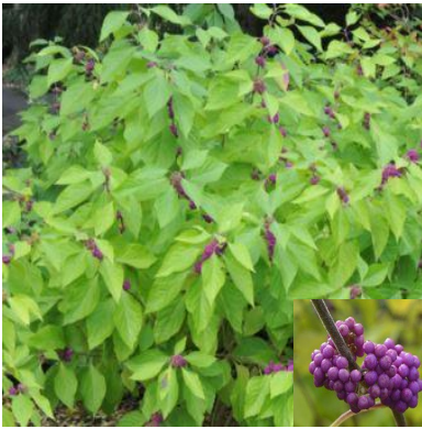
AMERICAN BEAUTYBERRY CALLICARPA A. LIGHT: FULL SUN TO PART SHADE HT: 5 FEET WD: 4 FEET HARDY SHRUB GOOD FOR MANY CONDITIONS THAT PROVIDES UNIQUE PURPLE BERRIES IN FALL