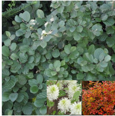
DWARF FOTHERGILLA FOTHERGILLA G. 'SUZANNE' LIGHT: FULL SUN TO PART SHADE HT: 2-3 FEET WD: 2-3 FEET EARLY SPRING FLOWERING SHRUB WITH AMAZING ORANGE FALL COLOR