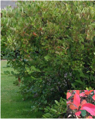
RED CHOKEBERRY ARONIA A.

LIGHT: FULL TO PART SHADE HT: 7 FEET WD: 3-4 FEET VASE SHAPED SHRUB WITH AMAZING BERRIES AND FALL COLOR