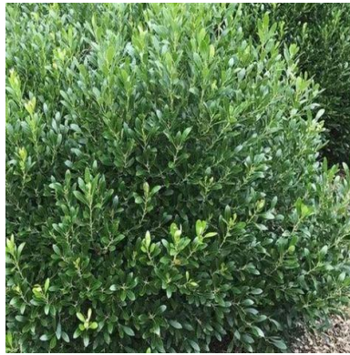
COMPACT INKBERRY ILEX G. 'COMPACTA' OR 'NORDIC' LIGHT: FULL TO PART SUN HT: 3-4 FEET WD: 3-4 FEET DENSE VERSION OF THE SPECIES INKBERRY THAT STAYS COMPACT