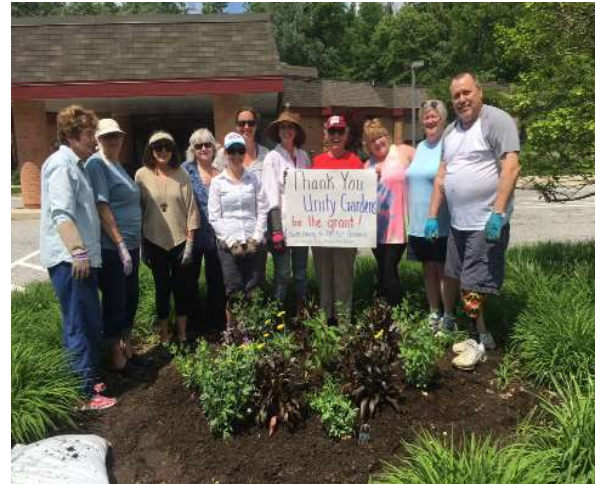
Master Gardener volunteers used grant funds to plant a native garden at South County Senior Center in Edgewater.